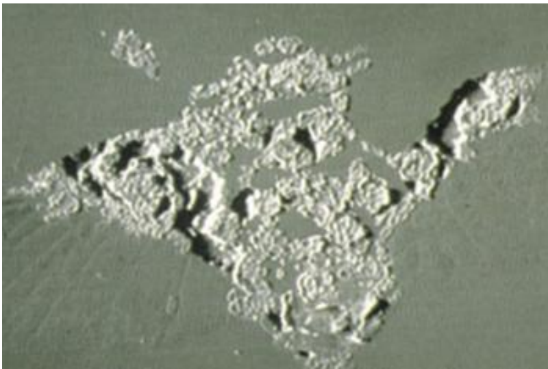
Markierung einer Fliege, 25fache Vergrößerung